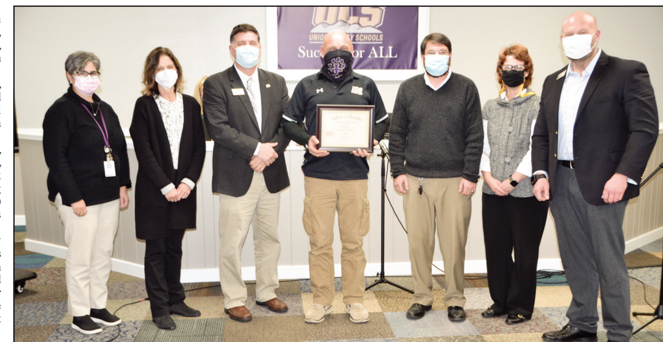
Union County Schools are deserving of congratulations after having earned the No. 1 graduation rate in the Pioneer RESA.

"The kid is already started from the house, and the See Board of Ed, Page 3A